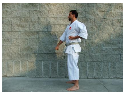
Ghedambarai - achinojidachi