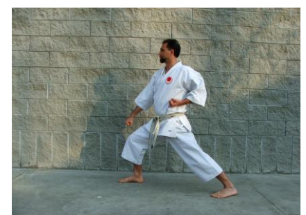
Ghedambarai - zenkutsudachi