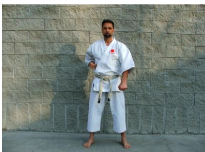
Ghedambarai - achinojidachi