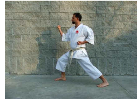
Uchiuke in zenkutsudachi