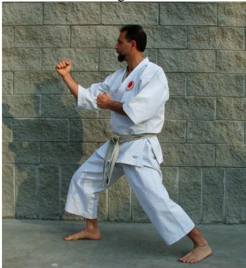
Kamae dx – guardia