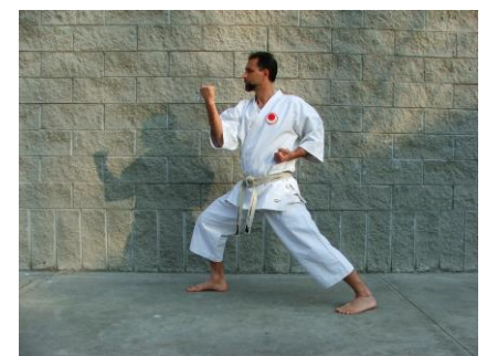
Sotouke in zenkutsudachi