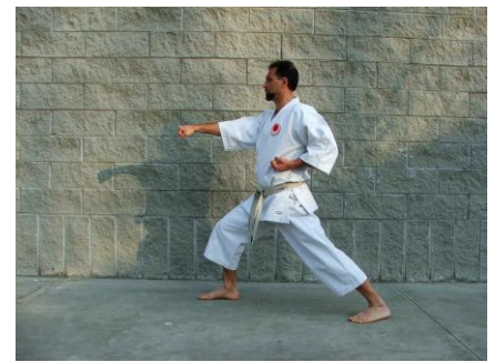
Oizuki con avanzamento