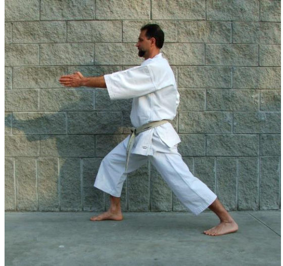
Nukite sx - posizione zenkutsudachi dx