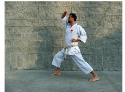
Agheuke in zenkutsudachi