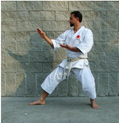
Shutouke dx - posizione koktsudachi